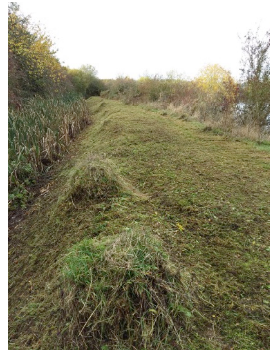
Brogborough - After clearance