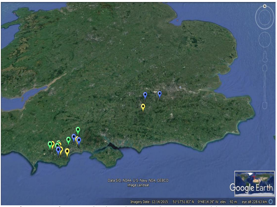
Map of survey sites for 2016 – Blue dots indicate sites that were surveyed, but no beetles were found, green dots are sites where only Green Tiger Beetles were recorded, and yellow dots are sites where Heath Tiger Beetles were recorded.