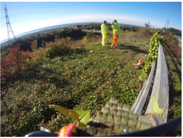
Portsdown - after