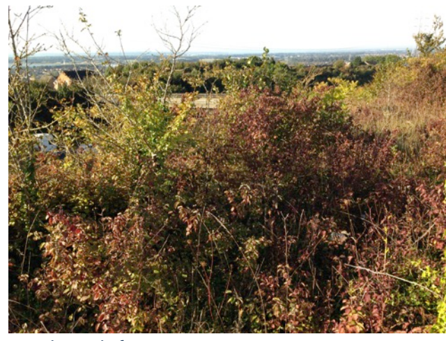
Portsdown - before