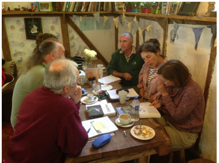
The Spiked Rampion Steering group tackling both rare species conservation and cake