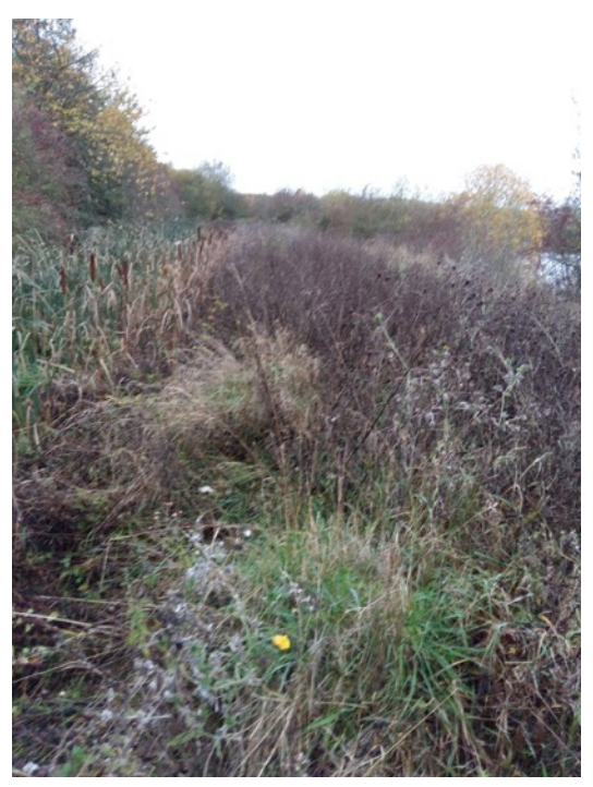
Brogborough - Before clearance