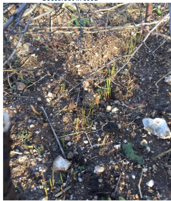
Darnel seedlings winter 2016