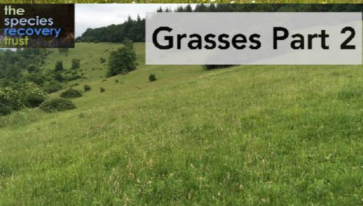
Grasses Part 2