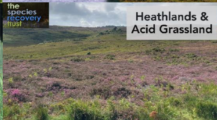
Heathlands & Acid Grassland