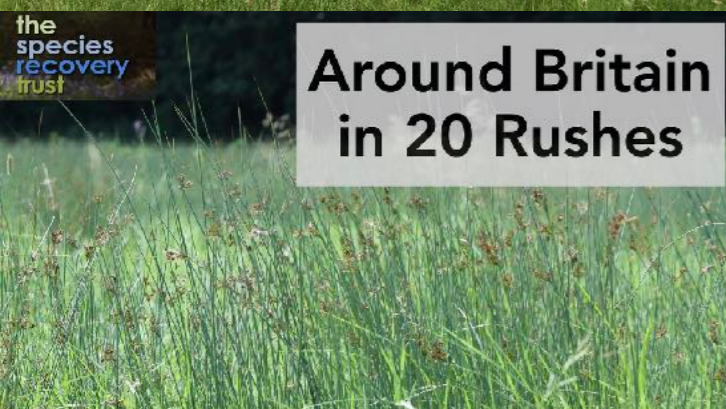
Around Britain in 20 Rushes