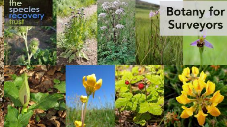
Botany for Surveyors