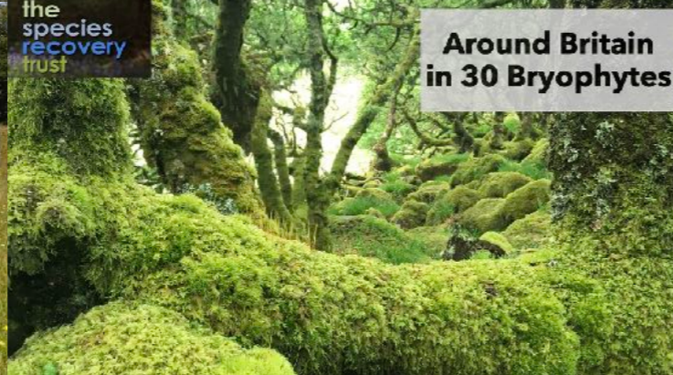
Around Britain in 30 Bryophytes