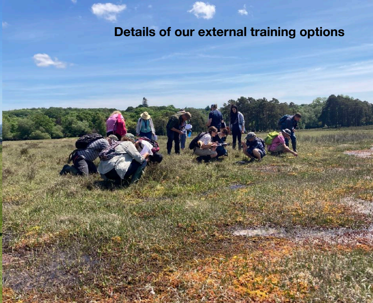
Details of our external training options