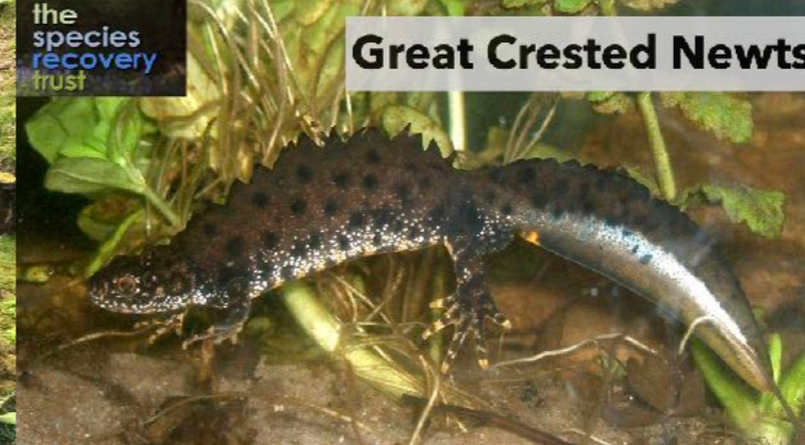
Great Crested Newts