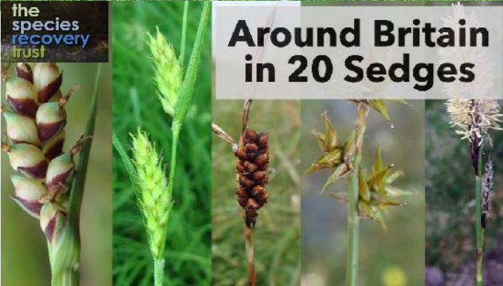
Around Britain in 20 Sedges