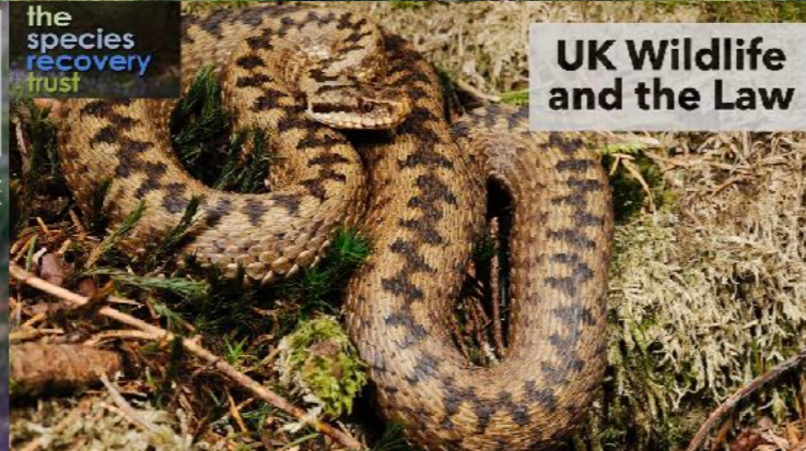
UK Wildlife and the Law