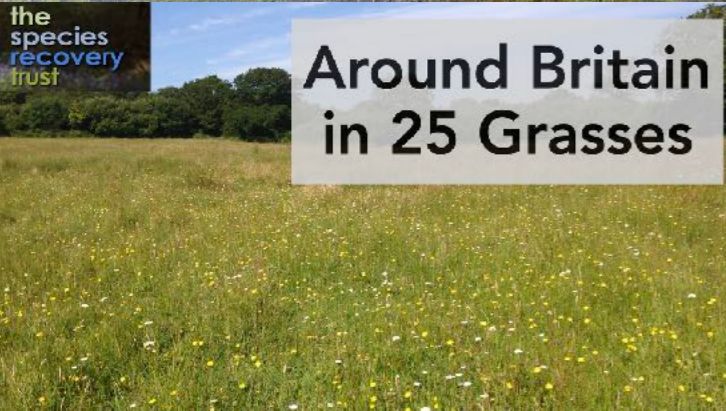
Around Britain in 25 Grasses