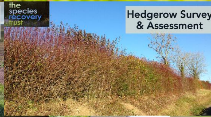
Hedgerow Survey & Assessment